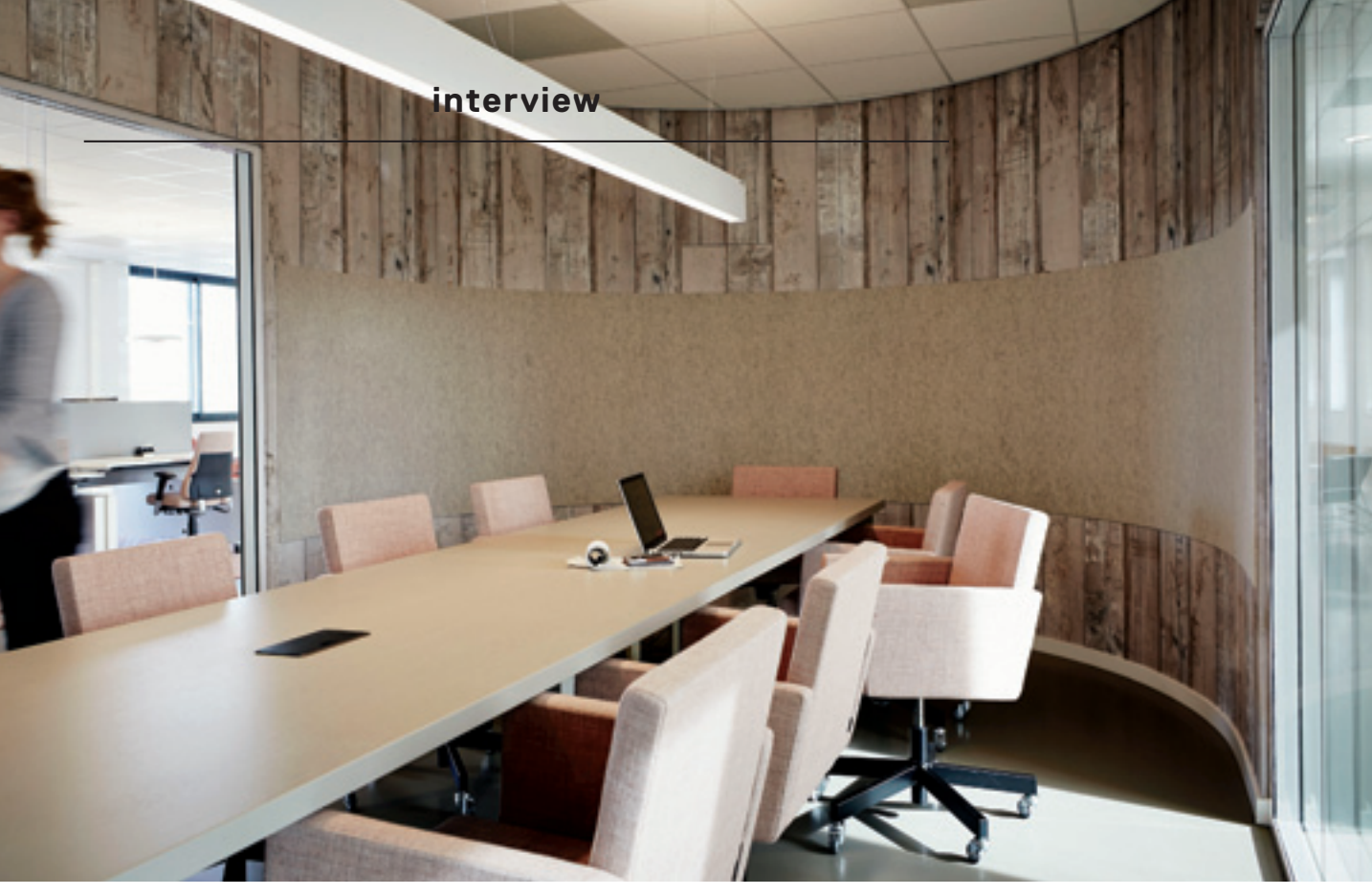
Round conference room, William Schrikker Group, Amsterdam, the Netherlands.

Clients from healthcare and educational sectors prefer synthetic flooring because they last a long time. This may come across as sustainable, but hazardous substances are used in the manufacturing process. Even though it isn't a matter of course yet, there are plenty of safe alternatives. By choosing the right materials, an interior architect can influence the production process of suppliers. Desso and Interface Flor are two examples of suppliers who consciously focus on sustainability, for instance."